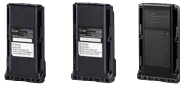
▲ BP-230N ▲ BP-232N ▲ BP-240