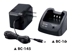
▲ BC-145 ▲ BC-160

BC-160 DESKTOP CHARGER + BC-145 AC ADAPTER Charges the BP-232N in 3 hours (approx.). BC-119N + AD-106 + BC-145 is also available. : Charges the BP-232N in 3 hours (approx.).