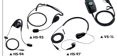
▲ HS-94 ▲ HS-95 ▲ HS-97 ▲ VS-1L

HS-94 : Earhook headset with flexible boom microphone. HS-95 : Behind-the-head headset with flexible boom microphone. HS-97 : Throat microphone fits around your neck and picks up speech vibration. VS-1L : PTT/VOX unit. Required when using these headsets with the transceiver.