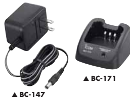
▲ BC-147 ▲ BC-171

BC-171 DESKTOP CHARGER + BC-147 AC ADAPTER Charges the BP-232N in 10 hours (approx.).