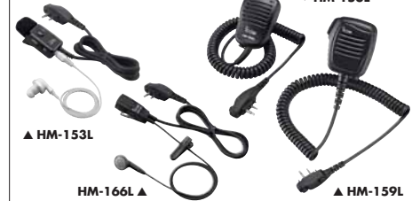
▲ HM-153L ▲ HM-166L ▲ HM-158L ▲ HM-159L

HM-153L : Durable earphone-microphone with revolving clip. HM-158L : Compact and durable body with plug screw connector. HM-159L : Full size durable speaker microphone. HM-166L : Light-weight earphone microphone with revolving clip. SP-13 : EARPHONE Provides clear audio in noisy environments.