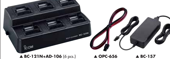
▲ BC-121N+AD-106 (6 pcs.) ▲ OPC-656 ▲ BC-157

BC-121N MULTI-CHARGER + AD-106 CHARGER ADAPTER + BC-157 AC ADAPTER (Six AD-106s are required) Charges up to 6 battery packs in 3 hours (approx.) when BP-232N is attached. OPC-656 DC POWER CABLE : For use with the BC-121N. (12–20V DC required).