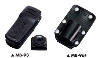
▲ MB-93 ▲ MB-96F

MB-93 : Swivel type belt clip. MB-94 : Alligator type. Same as supplied. MB-96N : Swivel type belt hanger. MB-96F : Fixed type belt hanger.