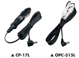
▲ CP-17L ▲ OPC-515L

CP-17L CIGARETTE LIGHTER CABLE, OPC-515L DC POWER CABLE For use with the BC-160 or BC-119N. (12–16V DC required).